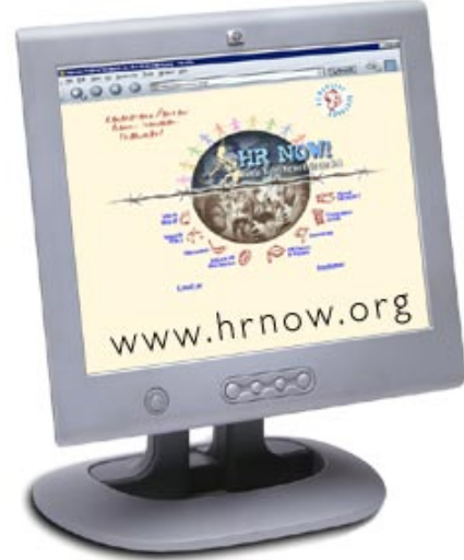
HR now!: human rights network at www.hrnow.org , one of the web sites included in the test set for the project.

for preservation by the Curator of the Echols Collection on Southeast Asia. The project will produce a framework and general specifications for ongoing, sustainable archiving in terms of resource management, curatorial practices, and technological requirements.