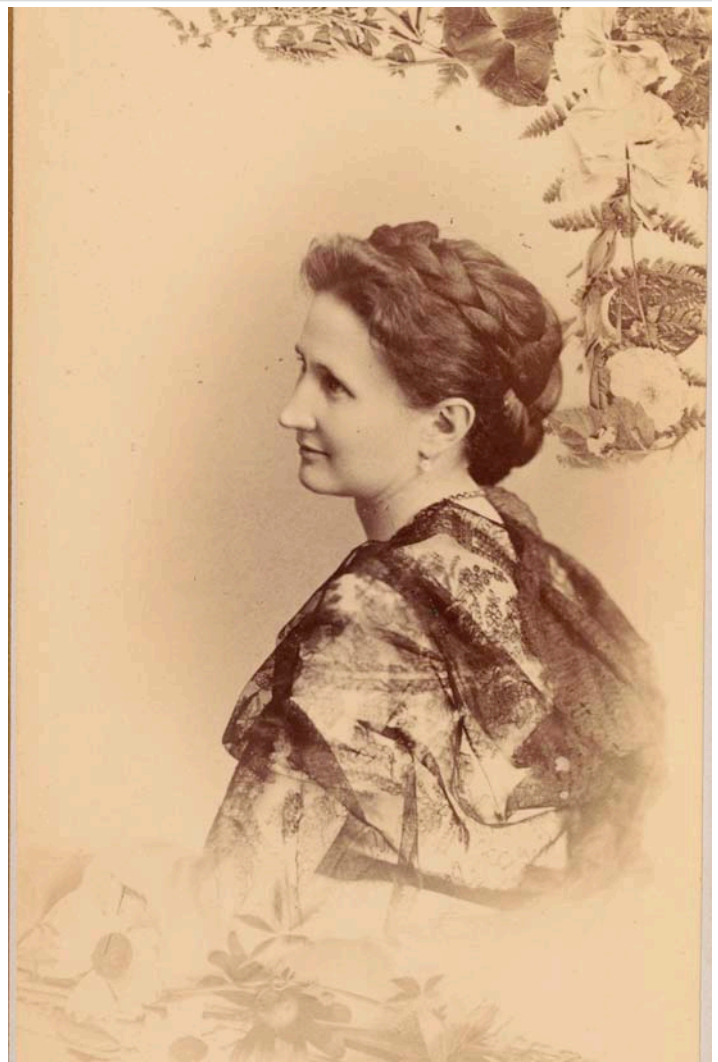
Beardsley. Portrait of Jennie McGraw , ca. 1880. Albumen print photograph

around 10,000 volumes. Once again, Willard Fiske acquired everything available and worth having. Among the printings from the Incunabula period (before about 1500) in the collection is a first (1472) edition of the Divina Commedia from the town of Foligno (Italy). Cornell's copy of the Foligno is remarkable for its decorative initials, marginalia, and robust condition. The editions and translations of Dante Alighieri's works—the Divina Commedia , the Vita Nuova , and other volumes of poetry and philosophy—are too numerous to suggest more than a few examples; as with Petrarch, Fiske's achievement with Dante was nothing less than spectacular.