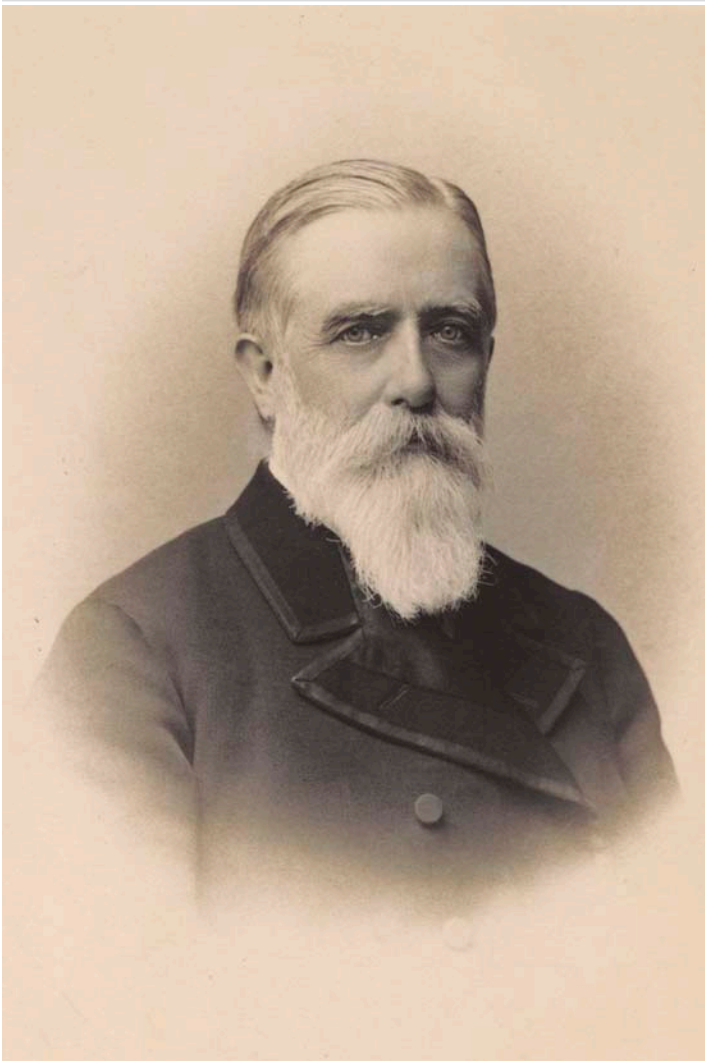
Michele Schemboche. Portrait of Willard Fiske , ca. 1900. Platinum print photograph