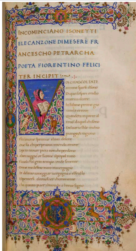
Decorated initial from Petrarcha, Trionfi, Canzoniere . Manuscript on vellum. Italy (Florence), 1465-1470.